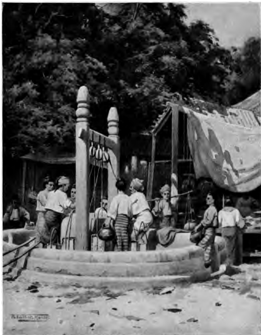
AT THE WELL.